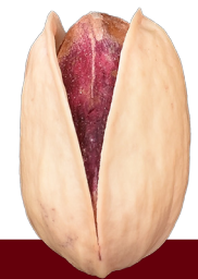
Ahmad Aghaei Pistachios